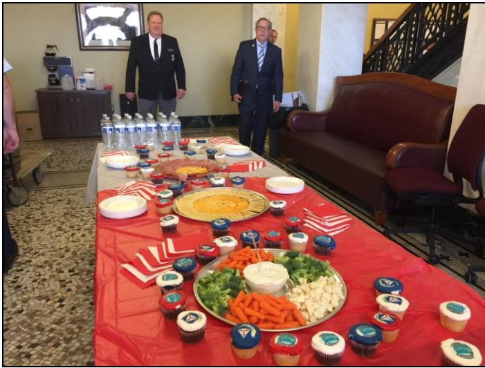
MID-AFTERNOON SNACK IN THE LEGISLATIVE CLOAKROOMS