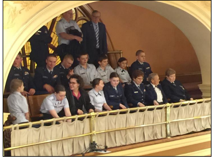
SDWG MEMBERS SIT IN ON A LEGISLATIVE SESSION