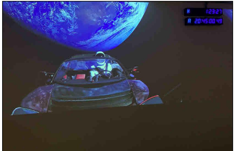
SPACE-X LAUNCHED A TESLA ROADSTER INTO SPACE ABOARD ITS FALCON HEAVY ROCKET ON 6 FEBRUARY. COMPANY CEO ELON MUSK TWEETED THIS PHOTO OF THE VEHICLE OVER AUSTRALIA