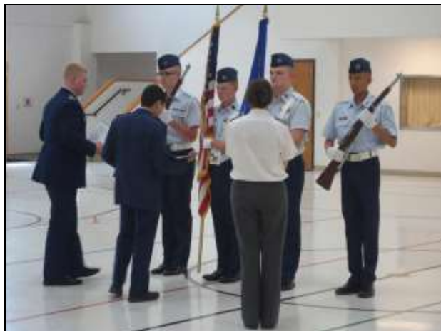
RUSHMORE COMPOSITE SQUADRON'S COLOR GUARD READY TO PERFORM AND UNDERGOING JUDGING