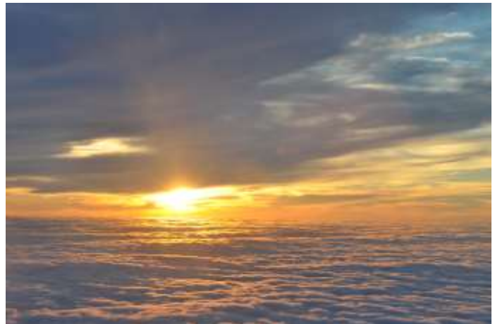
Text and sunset photo submitted by 1 st Lt. Brown, SFCS