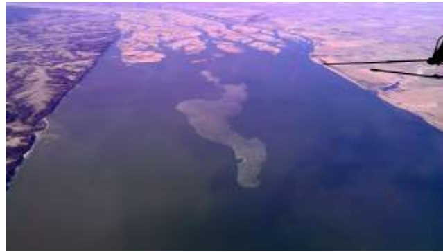
THOUSANDS OF GEESE REST ON THE MISSOURI RIVER